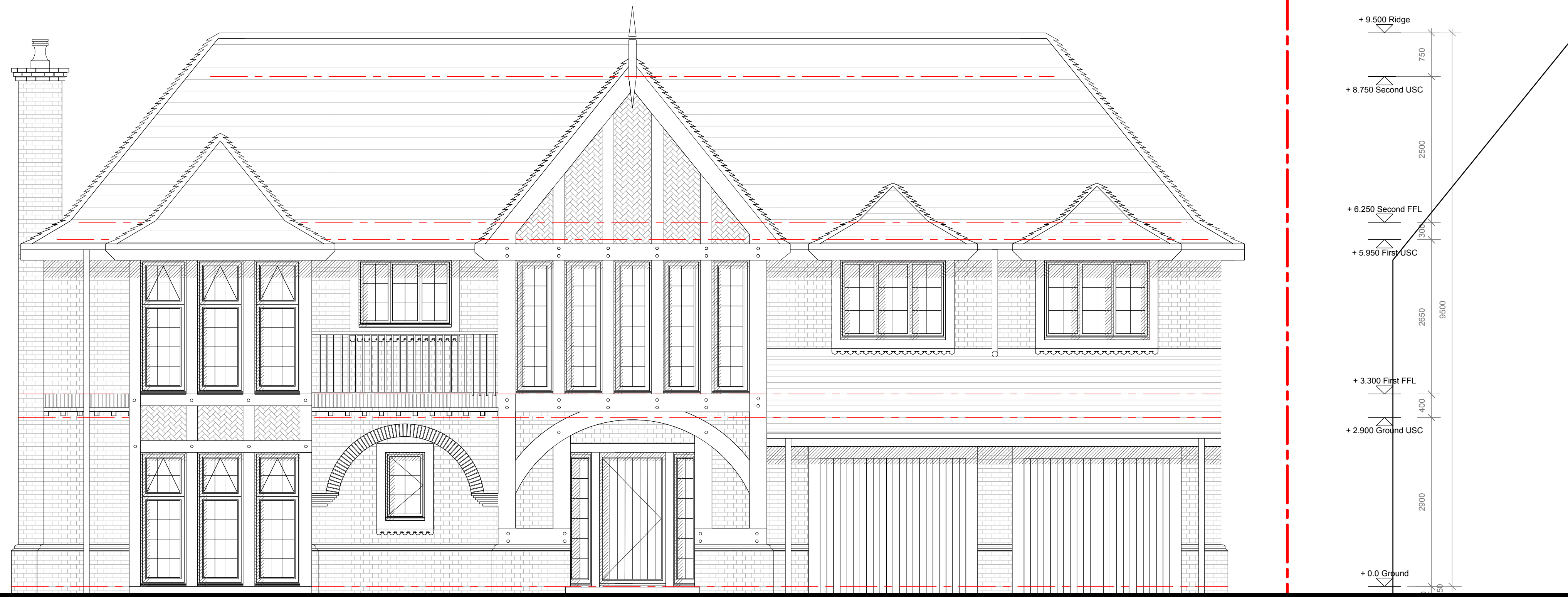
Front Elevation As Proposed 1:50

Notes Do not scale from this drawing. Do not fabricate any components from this drawing, all fabrications to be carried out using site dimensions only. Any errors or omissions on this drawing are to be reported immediately. CDM Notes: See engineers warnings regarding excavation structural steelwork erection and general in-situ concrete construction. Specific care should be taken for the lifting and erection of heavy pre-cast items (staircases, beam and block flooring etc).